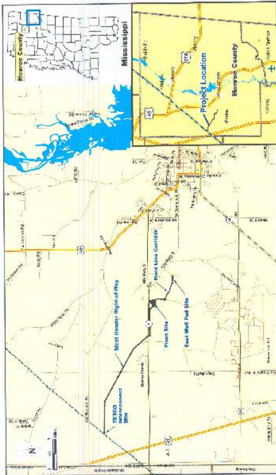
Figure 1-1 LOCATION MAP WHITE OAK GAS STORAGE PROJECT, MONROE COUNTY, MISSISSIPPI Tamara White Oak Gas Storage, LLC, Houston, Texas

© 2007 Starpon LLC. All rights reserved. Date: 01/23/2008 10:00 AM Project: White Oak Gas Storage, LLC, Houston, Texas